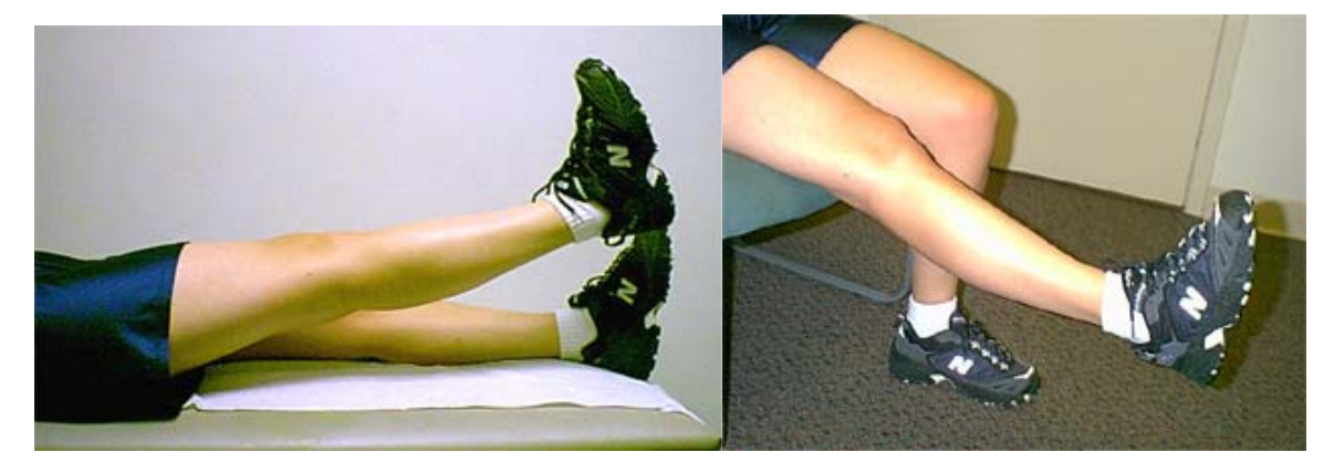
Figure 9. Straight leg raises – lying (left) and seated (right)

This exercise can be performed out of the brace when the leg can be held straight without sagging (quad lag). Once you have gained strength, straight leg exercises can be performed while seated. See Figure 9