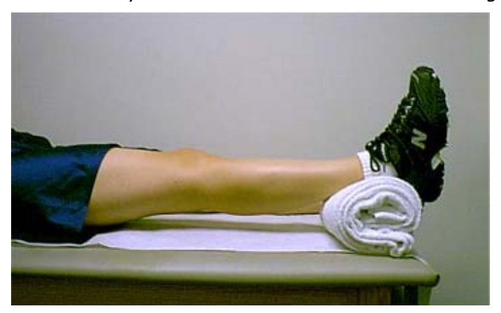
Figure 1. Heel prop using a rolled towel.