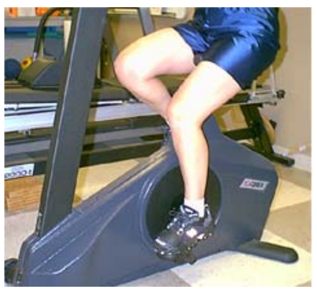
Figure 6. Stationary Bicycle helps to increase strength

1) Stationary Bicycle. Use a stationary bicycle two times a day for 10 - 20 minutes to help increase muscular strength, endurance, and maintain range of motion. See Figure 6