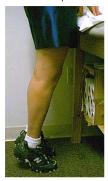
Figure 11. Toe Raise